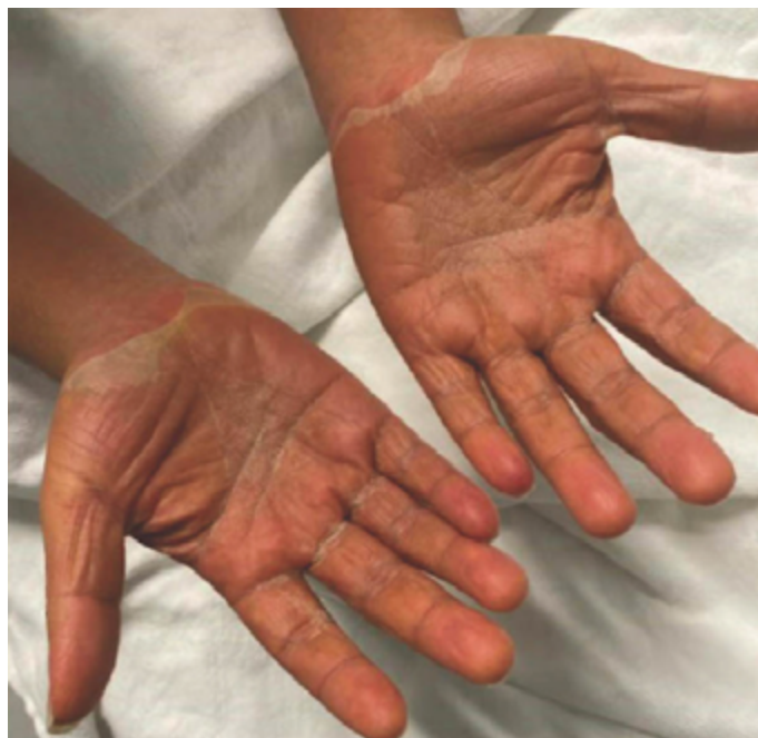
Figure 1. Desquamating rash of palms on day 2 of presentation.

Allopurinol is a xanthine oxidase inhibitor used for long-term gout management, and its metabolite, oxypurinol, is known to trigger a cytotoxic T-cell response and is thought to be the cause of allopurinol-mediated hypersensitivity. [11] Chronic allopurinol therapy for gout has been associated with transient liver enzyme abnormalities in 2–6%